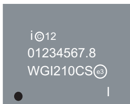
Figure 1-5. I210 Production Top Marking Example (Automotive Industrial Temperature Fiber)