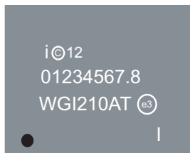
Figure 1-3. I210 Production Top Marking Example (Industrial Temperature Copper)