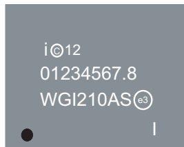
Figure 1-4. I210 Production Top Marking Example (Industrial Temperature Fiber)