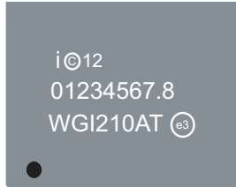
Figure 1-2. I210 Production Top Marking Example (Commercial Temperature Copper)