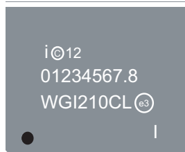
Figure 1-6. I210 Production Top Marking Example (Automotive Industrial Temperature Fiber <20 DPM)