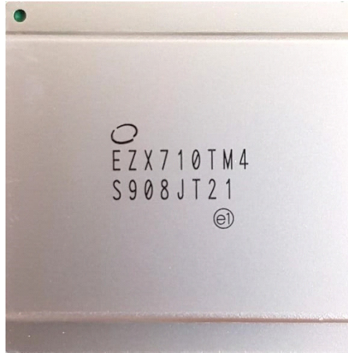
Figure 1-1. Example Component with Identifying Marks