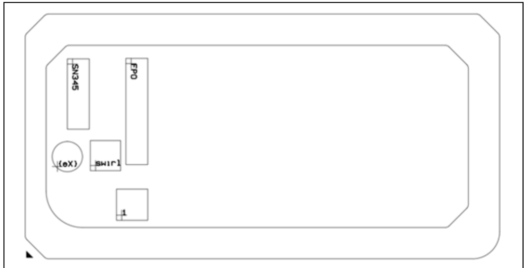
Figure 1. U-Processor Line Multi-Chip Package BGA Top-Side Markings