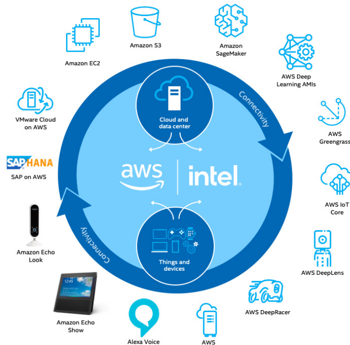
Figure 1. The AWS and Intel relationship extends across a wide range of cloud and Internet of Things (IoT) services