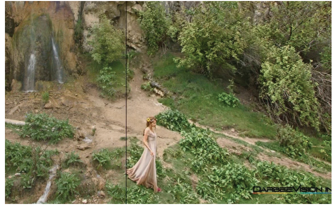
Source: 3840 x 2160, 24-bit Apple ProRes* 422HQ Output: DVP, Mode High Definition, Setting 090