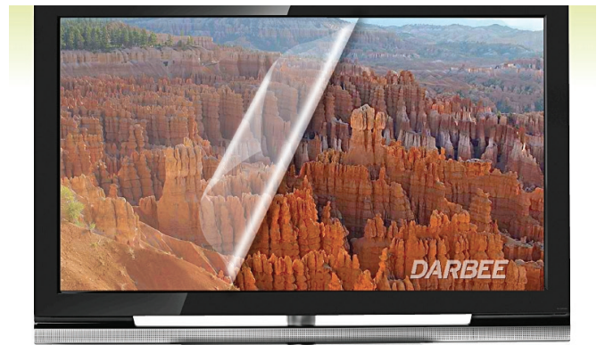
Source: 1024 x 768, 24-bit JPEG Output: DVP, Mode Full Pop, Setting 090