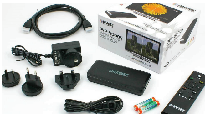
Intel® Cyclone® IV FPGA used for the DARBEE Visual Presence, DVP-5000S

DarbeeVision is headquartered in Orange, California and recently opened a business unit in Shenzhen, with funding from Plug and Play China, and established accelerator partnerships with Vanke (Beijing) and LeaguerX (Shenzhen).