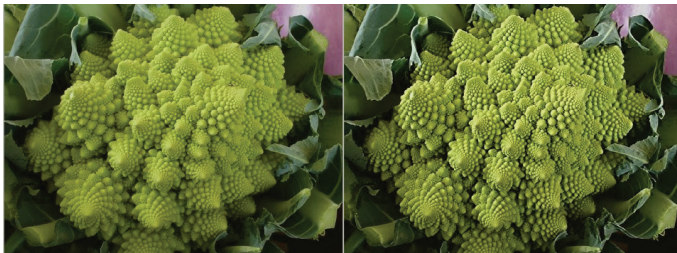
Source: 478 x 358, 0.34MP, 24-bit BMP Output: DVP, Mode Full Pop, Setting 090

DVP algorithms analyze the image on a pixel basis to compute the lost depth data, similar to the human visual system, and then adjust pixel luminance across the entire image to enhance image quality by adding information required to better see and understand it.