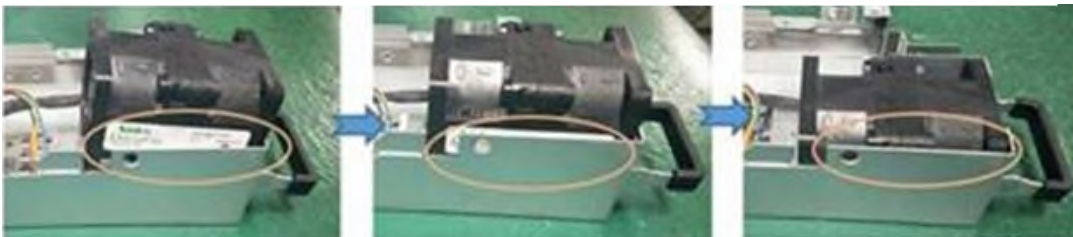
Figure 3. Label is now covered and protected by power supply chassis