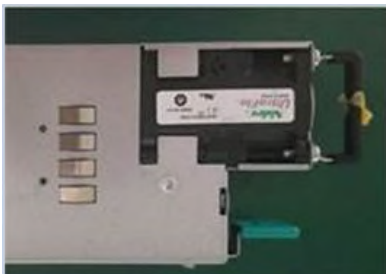
Figure 1. Previous Label Location

Intel is changing the location of the 1100W power supply fan label so that the label is covered and protected by the power supply chassis.