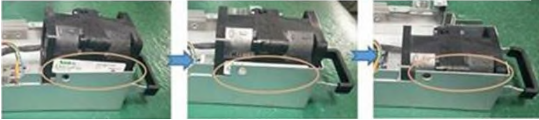
Figure 3. Label is now covered and protected by power supply chassis