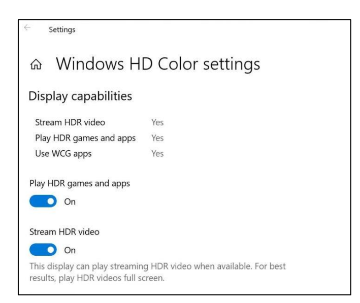
Figure 2. Screenshot Showing HDR Mode Turned on in Display Settings Page

As soon as you activate this switch, everything on screen may immediately appear darker, and by comparison desaturated or washed out. This is because most applications and content are SDR while your system is now in HDR mode. For SDR and HDR content to appear at the same time, the SDR content must be shown darker than the HDR. You will also find that if the color gamut of the display is wider than sRGB, transition to HDR mode will make the desktop appear washed out, compared to SDR mode where the sRGB colors looked oversaturated due to color mapping (stretching sRGB to panel's wide color gamut). To adjust the relative brightness of SDR and HDR content, use the slider under 'HDR/SDR brightness balance' setting in Windows HD Color Settings.