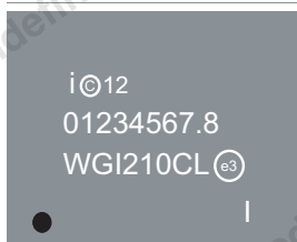
Figure 1-6. I210 Production Top Marking Example (Automotive Industrial Temperature Fiber <20 DPM)