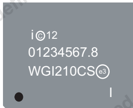
Figure 1-5. I210 Production Top Marking Example (Automotive Industrial Temperature Fiber)