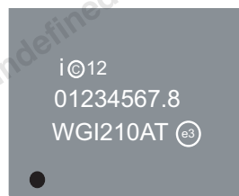
Figure 1-2. I210 Production Top Marking Example (Commercial Temperature Copper)