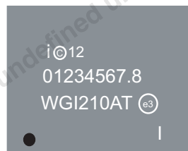
Figure 1-3. I210 Production Top Marking Example (Industrial Temperature Copper)