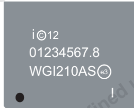
Figure 1-4. I210 Production Top Marking Example (Industrial Temperature Fiber)