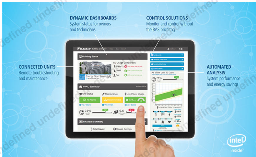
Figure 1.2 Daikin Intelligent Equipment Offerings Overview

The solution offers customers with packaged rooftop systems as their primary HVAC solution an alternative to the traditional management approach supported by external controls contractors or traditional building automation systems. Intelligent Equipment offers remote access, trend information, energy monitoring and management, diagnostics, and alarm management as an embedded feature of the new rooftop unit. The image below illustrates the visualization and reporting interface accessible via Daikin Intelligent Equipment.